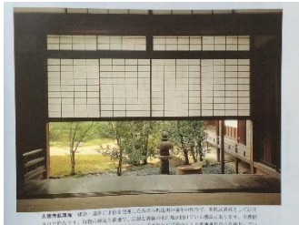
Kohouan(1612) sitting on the floor wood,paper&soil