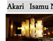
Akari Isamu Noguchi 1951 Bamboo&paper (warm & natural design)