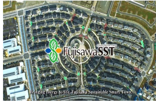
Fujisawa SST(1994) by Fujisawa city & Panasonic smart city with ecology, energy, traffic, education, medica, and lohas-systems