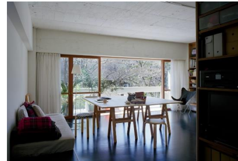
Room K (2016) By Inui Architects Utilization of existing structure, removal of inner wall, migration plan, built-in storage