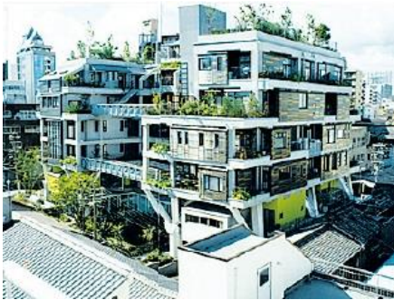
Experimental condominium(1993) by Kansai Electric Power Co.Ltd. eco-housing with roof garden, skelton-Infill system & co-generation energy system