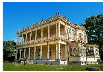
IWASAKI Hisaya House(1896) western style+Japanese style VIP’s housing in Meiji Era