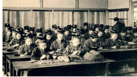
Compulsory Education(1886) sitting on chairs in classroom modern public education