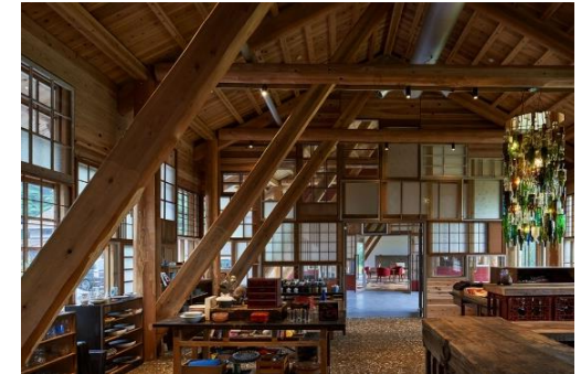
Kamikatsu zero waste center(2020) by Hiroshi Nakamura & NAP Utilization of waste materials / recycling, Local production for local consumption, sustainable system